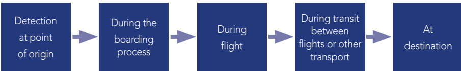
Figure 3. Potential points of public health hazard detection or notification

During air transport, a potential public health risk may be detected at various points, depending on the nature of the exposure, status of global alerts and awareness of various parties (Figure 3).