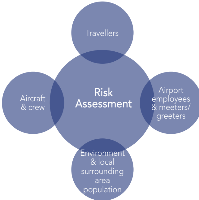
Figure 4. Iterative process for risk assessment

The WHO event management for international public health security - Operational Procedures (28) describes risk assessment as an iterative process that continues from the time the event is first detected to the time the event is “closed”. The estimate of potential risk from the public health event is a critical phase to determine which, if any, public health measures may be required to manage the event. The port health authority must conduct this phase in collaboration with other stakeholders who may have information concerning the public health event.